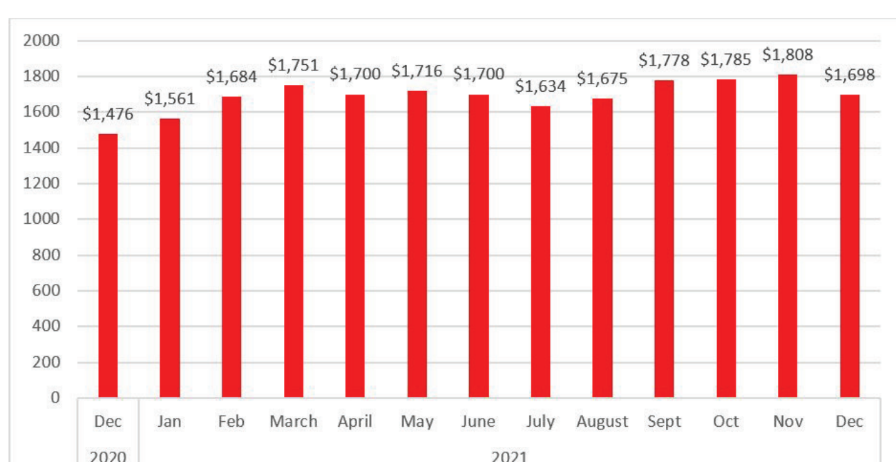
Average Price of Detached Homes in the City of Toronto 2021 ($ Thousands)

This was a decline from the fall sales price results. Rather than a decline in house values over the previous three months, this is more a reflection of fewer higher priced houses sold in December which brought down the average.